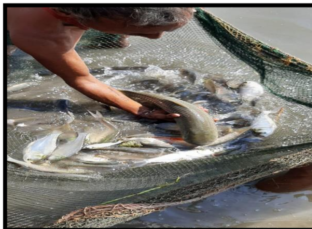
Good quality fish stock ready to reach market