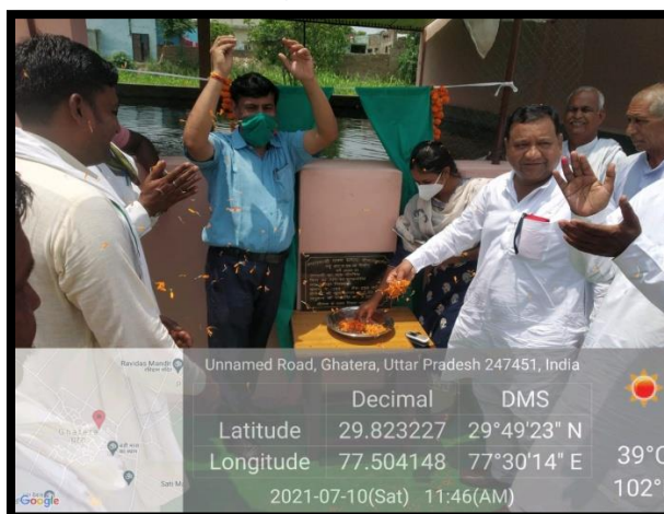
Inauguration of the mini RAS under PMMSY scheme on the occasion of Fish Farmer's Day 2021