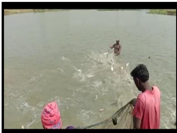
Harvesting in the fish farm