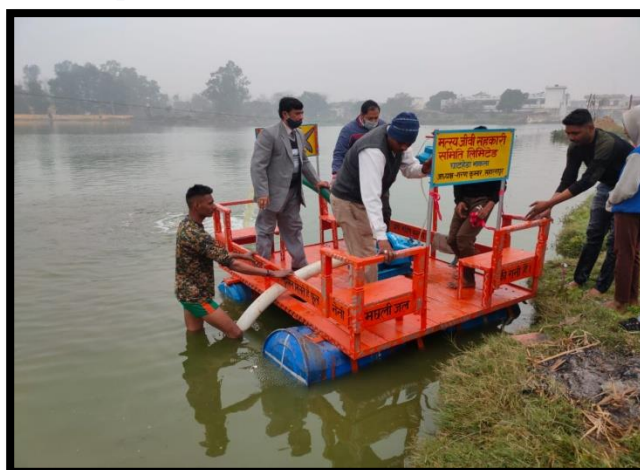
Innovation: Aerator cum boat