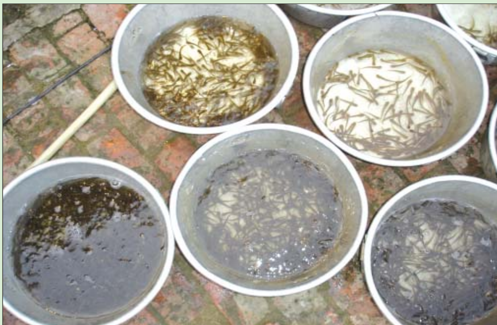
Fig. 15 : Stockable Pabda fingerlings