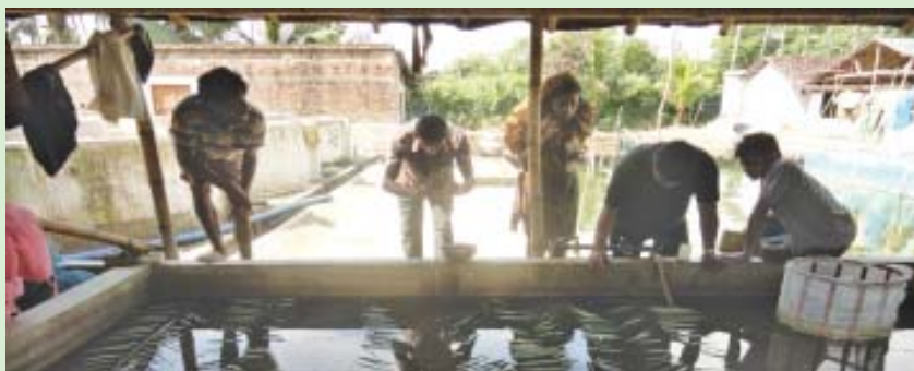
Fig. 10 : Rearing of Pabda fry in cemented tank

Spawn rearing can be carried out in FRP tank and cement cisterns. The water temperature and dissolved oxygen level are to be maintained in between 28°C -32°C and >5 mg/l, respectively. Initially the water level of the container should be 7-10 cm, which can be gradually raised up to 15-20cm after a period of one week. The water level is adjusted in accordance with different stages of larval development so as to minimize stress on the larvae. The container used for larval rearing are provided with a soil base of 5 - 6 cm thick. Periodically water exchange is essentially required. It is always better to use pond water after filtration during larval rearing. Provision of maintenance of feeble water current or flow of water in the container / fiberglass tank is necessary for obtaining better survival. Non chlorinated Water having lower alkalinity and hardness in carbon rich base is conducive for better spawn growth. In a better management practice, stocking density may be as high as 10-20 larvae / liter of water.