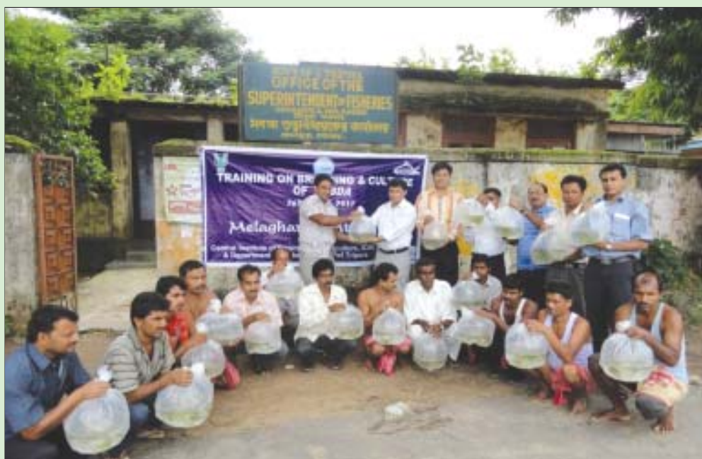
Fig.33 : Distribution of Pabda seed at Melaghar, Tripura