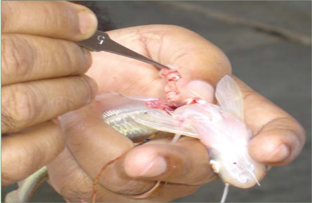
Fig.17 : Removal of testes