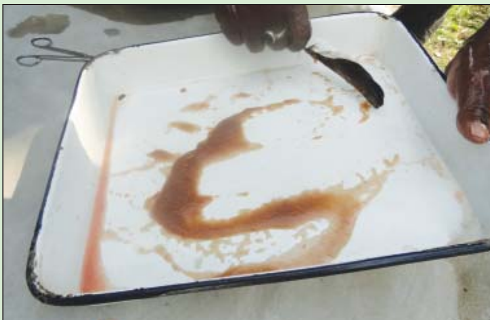
Fig.6 : Mixing of eggs with sperm suspension