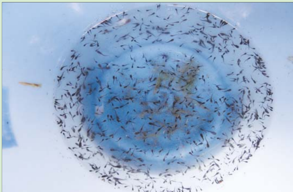
Fig.12 : Fry of Pabda