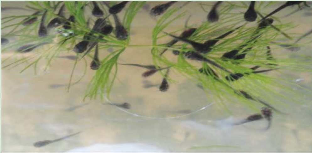
Fig.8 : Fry of pabda