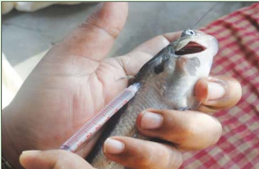
Fig.5 : Hormone injection to pabda brooder