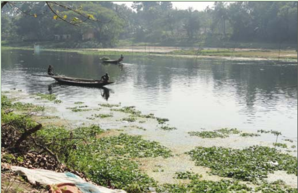
Fig.18 : A view of natural habitat of Pabda