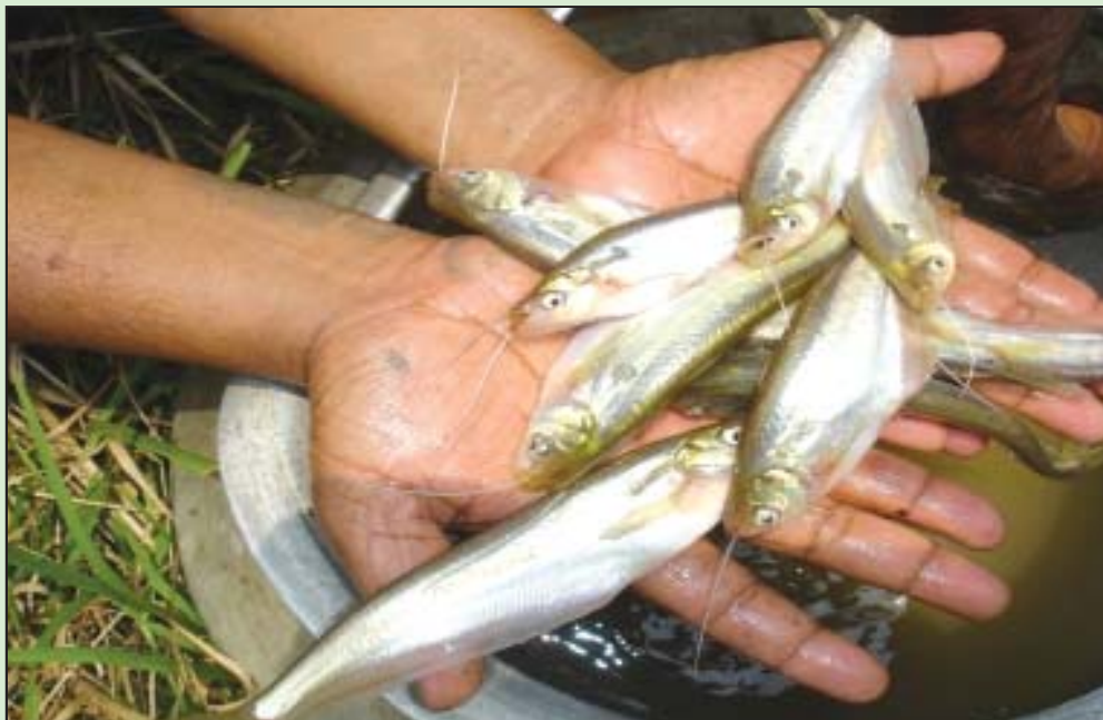
Fig.3 : Advanced fingerling of pabda at kalyani CIFA