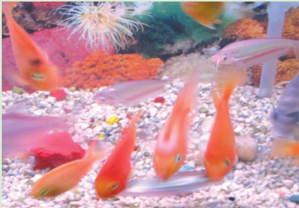
Fig.20 : Pabda with other Aquarium fishes