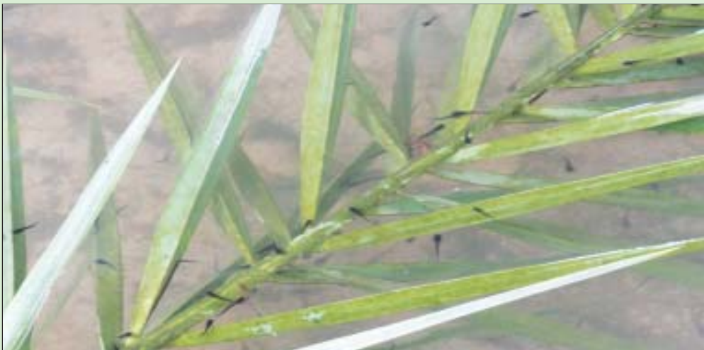
Fig.9 : Hideout for shelter of pabda fry, fingerlings