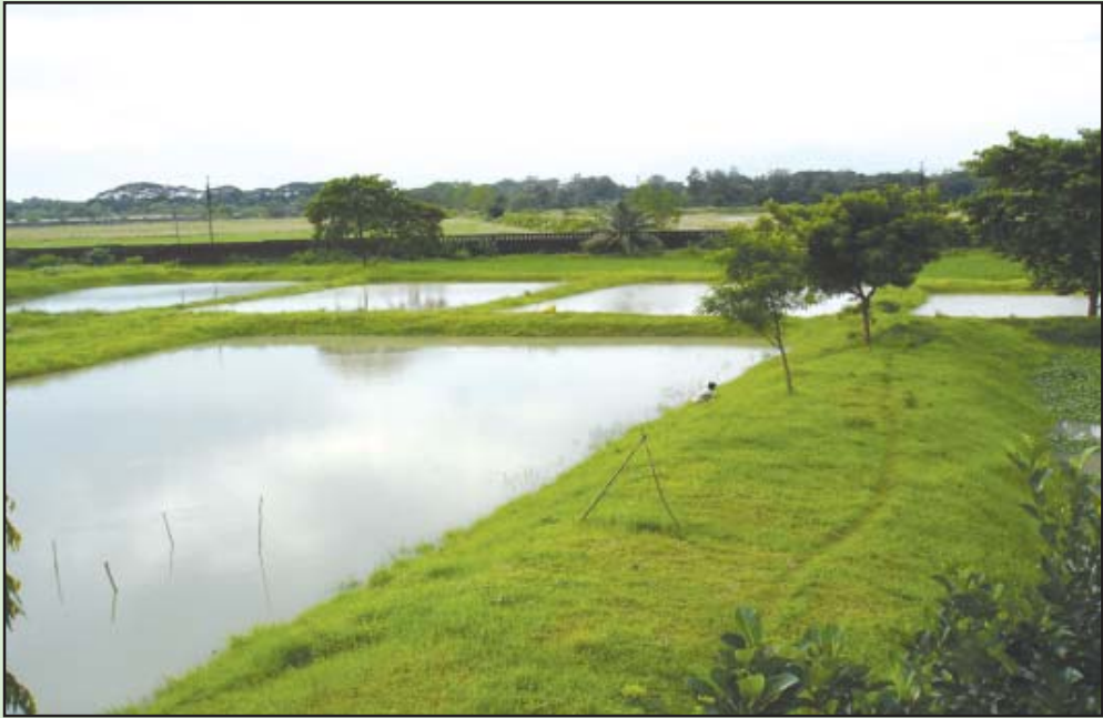
Fig.1 : A view of Kalyani, CIFA farm