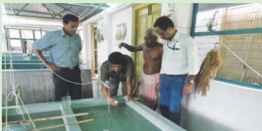
Fig. 11 : Checking of Water quality for better management