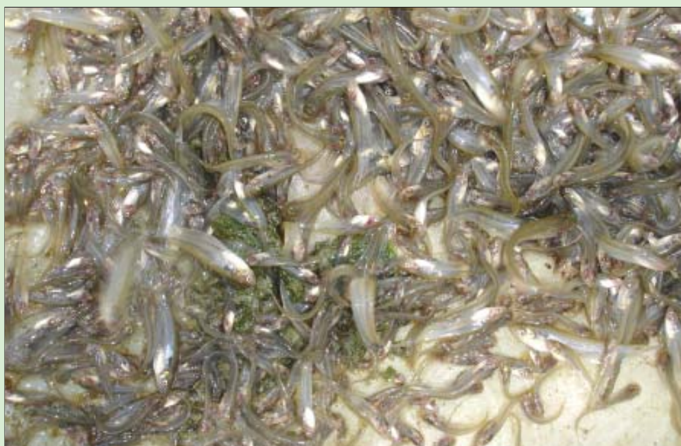
Fig.13 : Advanced fingerlings of Pabda