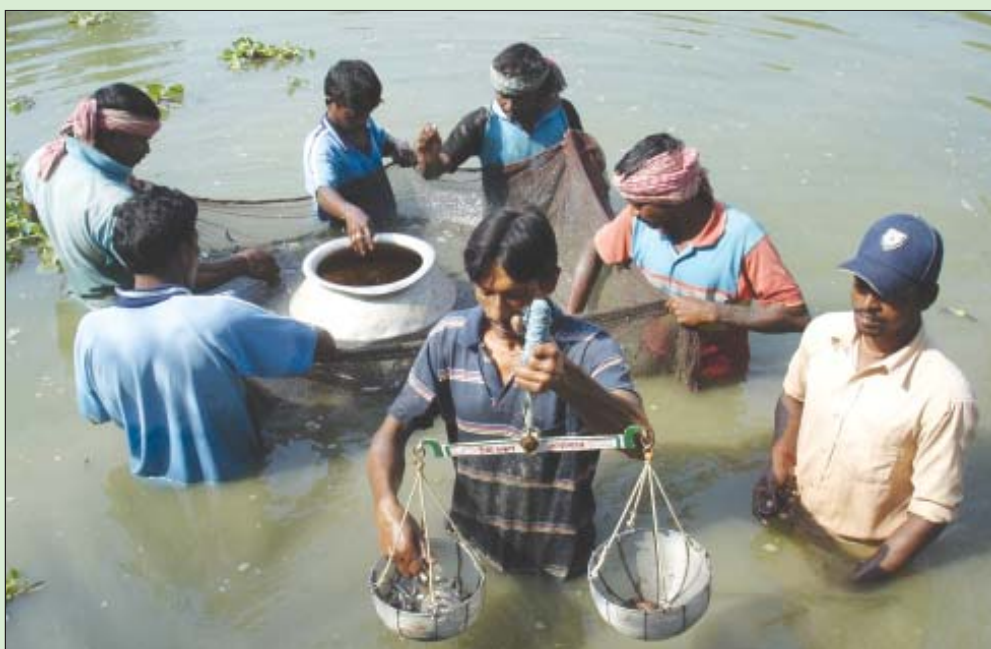
Fig. 16 : Sampling of Pabda at farmers field