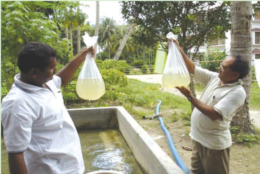
Fig.22 : Pabda seeds are distributed to a farmer from CIFA, Kalyani