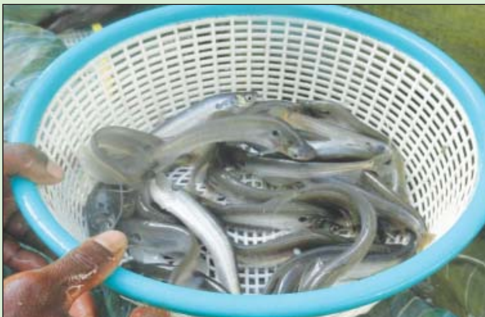
Fig.4 : One Year old pabda at Kalyani, CIFA