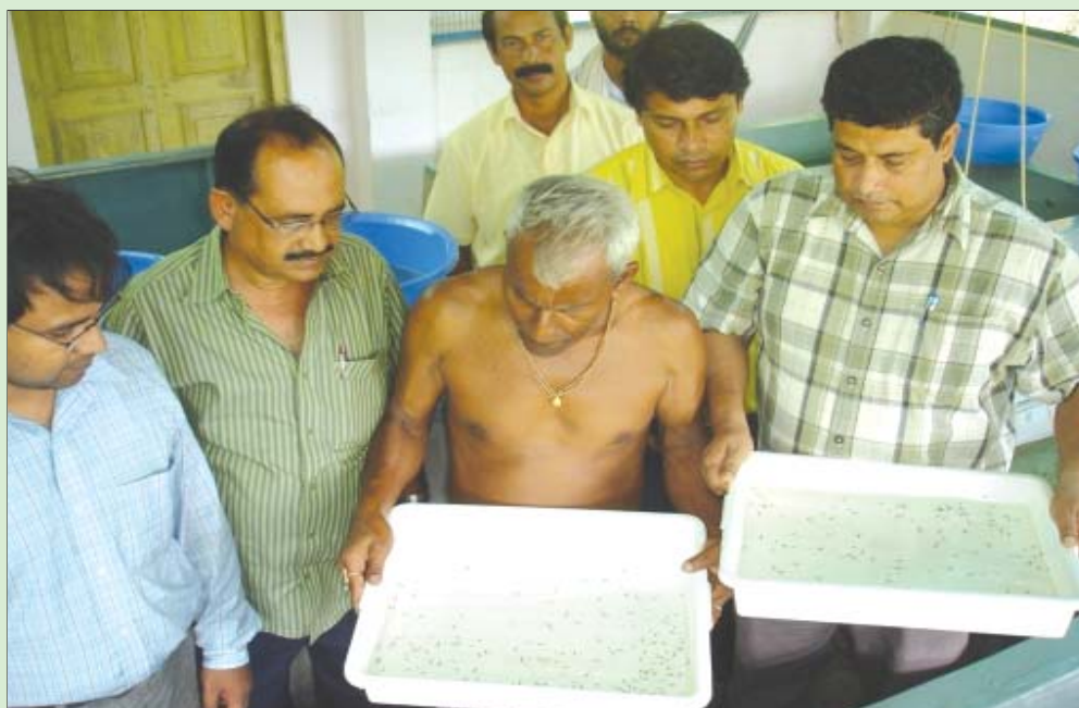
Fig.30 : Showing of Pabda fry at Lembuchera farm