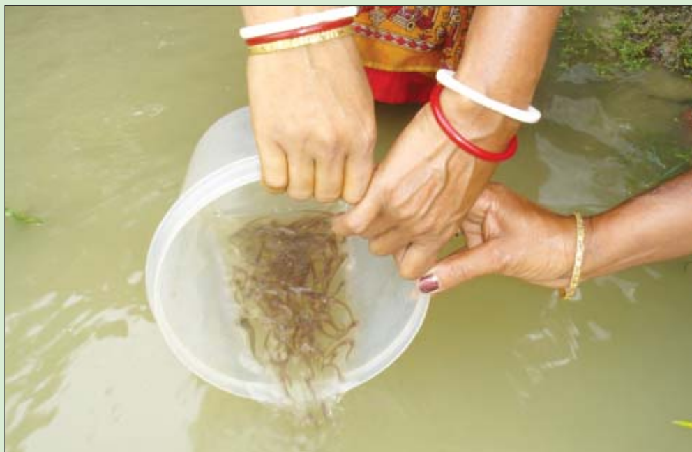
Fig.32 : Release of Pabda fingerlings