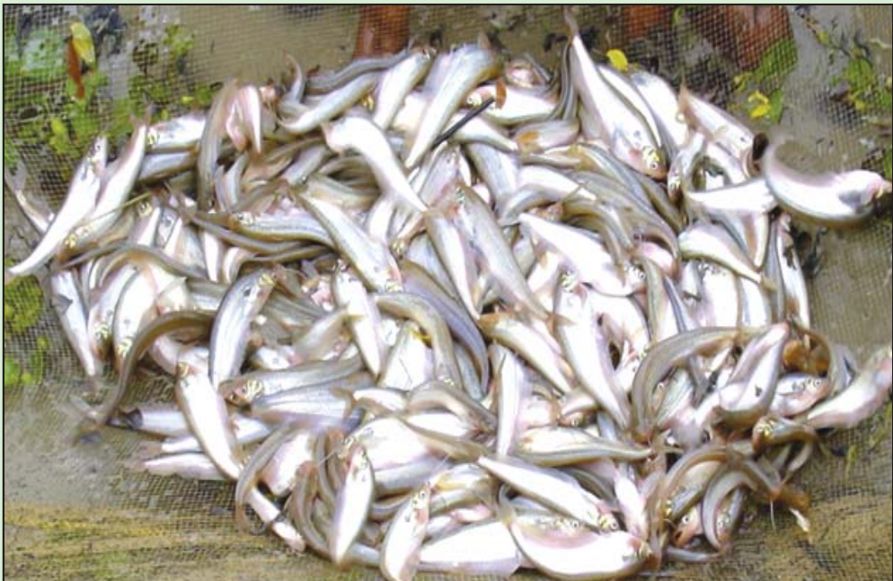
Fig.2 : A haul of pabda