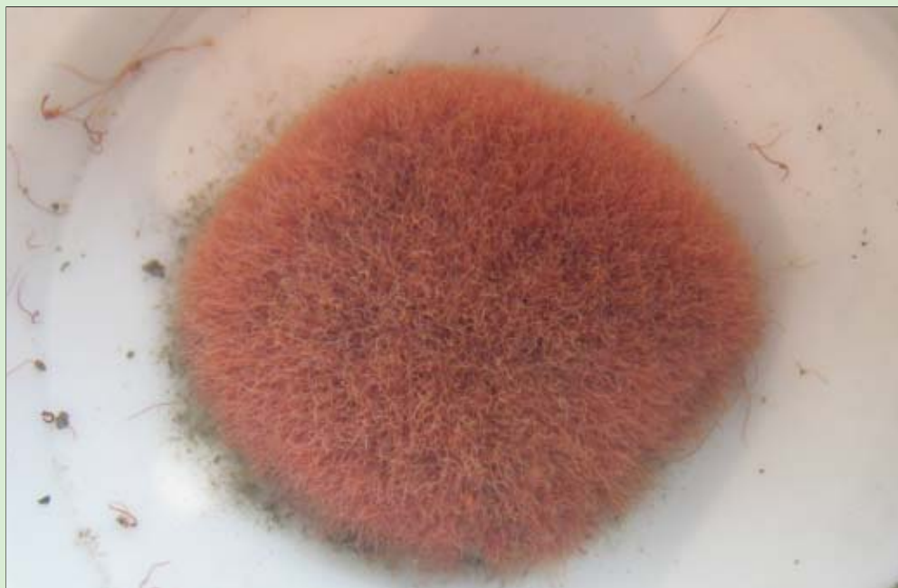
Fig.19 : A view of Tubifex colony